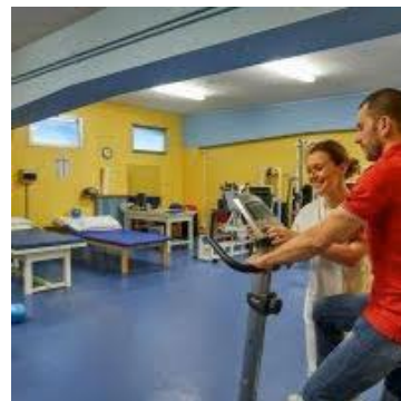
Pictured above: Rehab gym at Fondazione F. Turati Pistoia